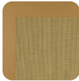
Porridge & Magnum