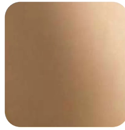
Light beige vinyl