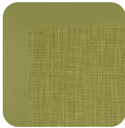
Guacamole & Wasabi