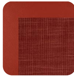
Tomato & Red October