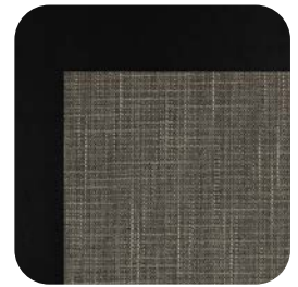
Zinc & Cobalt