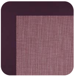
Elderberry & Aubergine

A woven back matched up with a vinyl base for that ultimate unique look